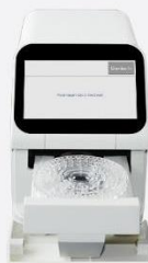
2. Insert disc