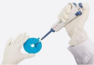
1. Add sample & diluent

From sample to complete results in 3 simple steps in approximately 13 minutes