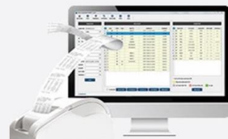
3. Read results